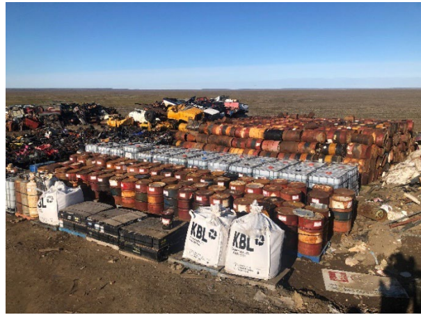
Collected hazardous waste for removal in Sachs Harbour

As this clean-up work is completed, MACA will follow up with community governments to make operational improvements to prevent future stockpiles and reduce waste. These improvements include more frequent compaction, which saves space, reduces fire risk, helps manage bear attractants and decreases wind-blown debris. Other management practices, such as better segregation and setting regular removal schedules, prevent stockpiles from recurring. This partnership has made a significant difference at community government solid waste sites.