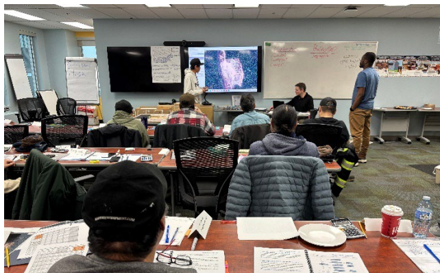
Participants in a Solid Waste Management Course in January 2026.

Upcoming work will also include the Coastal Communities Roadmap, the “Planned Relocation due to Climate Change” guide, and community plan bylaw updates that incorporate climate change adaptation initiatives.