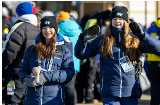
Members of Team NT at the 2026 Arctic Winter Games

The 2026 Arctic Winter Games were held in Whitehorse, Yukon, from March 8–15, with Team NT sending 356 participants to represent communities from across the territory. Team NT recorded strong performances across sport and cultural events, reflecting the continued development of athletes and leaders from across the territory. MACA remains committed to supporting multisport games, recognizing their importance in fostering athlete development, cultural exchange, and community engagement across the NWT.