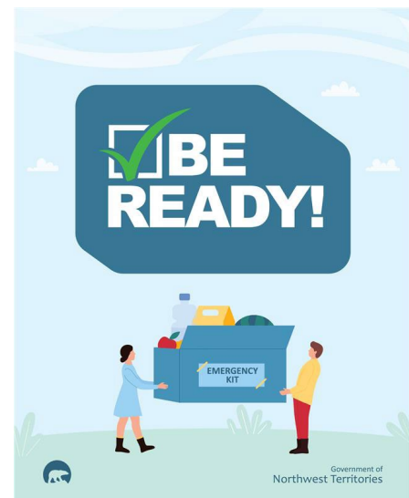
A promotional piece from the revamped Be Ready! Campaign

Emergency preparedness is everyone's responsibility. To raise awareness of potential disaster risks and actions that can be taken, MACA has launched a revised Be Ready! Campaign. The campaign normally ran during high risk season during the summer months, but has now been expanded to run throughout the year and is designed to encourage individuals and households to prepare for emergencies in advance. MACA also continues to provide community governments with general training, planning information, templates and tools, and direct contact with dedicated Regional Emergency Management Coordinators (REMC) who help deliver workshops and exercises to prepare for emergencies.