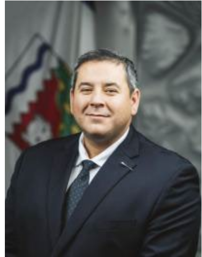
The Honourable Vince McKay Minister, Municipal and Community Affairs

I want to recognize the important work of NGOs in serving residents of the Northwest Territories. The Department of Municipal and Community Affairs and the Government of the Northwest Territories remain committed to supporting organizations that carry on this important work.